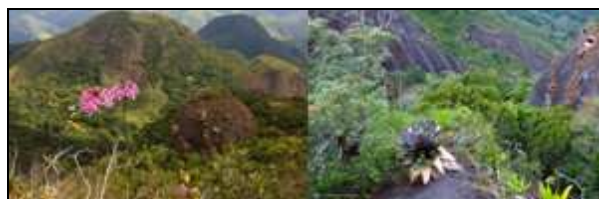
Figure 2. Rocky mountains with some vegetation at the peak of Pedra Riscada – Macaé/RJ.

can be used to map these tiles. The only confusion was a misclassified Forest area with a Rocky mountain area. This error may have occurred because of the presence of vegetation in some mountains, which behave similarly as a vegetation patch (Figure 2).